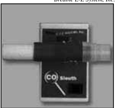
Breathe E-Z System, Inc.

Random breath-testing—whereby police have the legal authority to stop and demand an alcohol breath test from any driver at any time—has been demonstrated to be particularly effective, 55 but is impermissible in the United States as a constitutional matter.