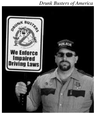
Although police want to create the impression that all drunk drivers will be arrested, in reality only a small percentage of drunk drivers on the road at any particular time will in fact be stopped or arrested.

Compounding the difficulty of estimating impairment is the fact that some police officers try to arrest only those drivers who they believe have high blood alcohol concentrations, either because they prefer to prosecute only strong cases or because they do not want to be criticized for wasting scarce police resources on borderline cases. Consequently, some officers systematically fail to arrest impaired drivers because they are only searching for the most impaired.