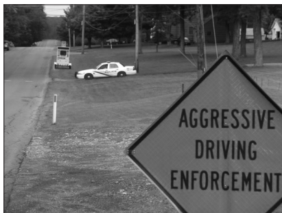
Example of high-visibility aggressive driving enforcement.

Pennsylvania Department of Transportation.