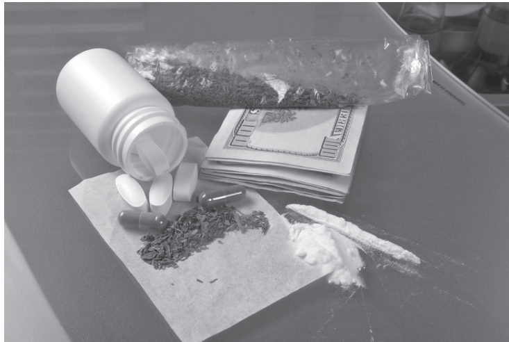
Many home invasion robberies are drug rip-offs in which the drugs or cash are the target.

Yet, home invasion robbery is distinct from these crimes. 2 Street robbery occurs in public or quasi-public space and victims are pedestrians, not occupants. Most residential burglars try to avoid confrontation, but home robbers seek it. Residential burglars who confront and rob unexpected occupants are not necessarily home robbers, because they did not intend to commit robbery when they entered the home. 3