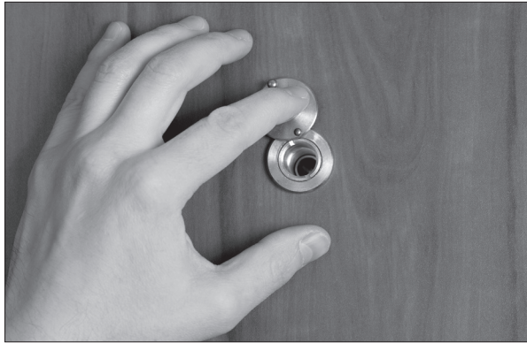
Door peepholes can help prevent home invasions.