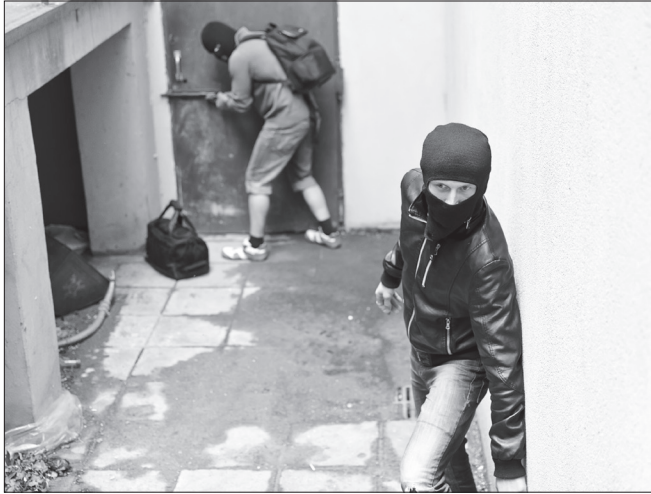
Most home invasions are committed by groups of young men.

In general, victims report home robberies to the police more frequently than street robberies. 55 However, there are several reasons why they might not: victims either are involved in crime, fear repeat victimization or retaliation, or distrust police. 56