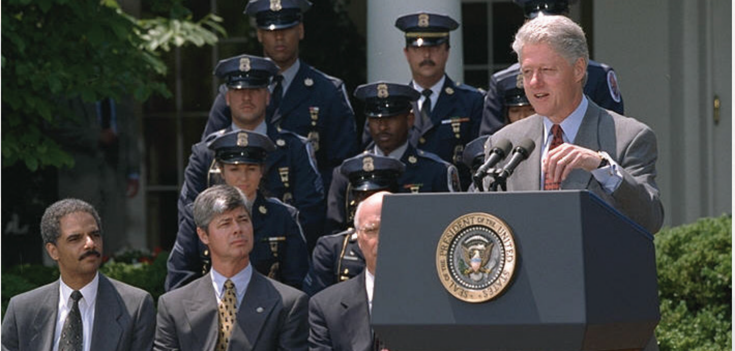
Above: On May 12, 1999, President Bill Clinton announced during a White House Rose Garden ceremony that the COPS Office had accomplished its initial goal of funding 100,000 officers.