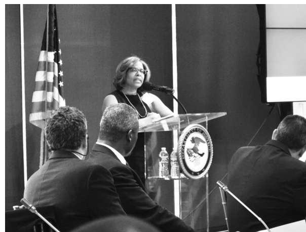
Assistant Attorney General Karol Mason

We must collaborate, but law enforcement has a presence of trauma that we must work through on all sides. Our power as a network is to have collaborative strategies. Positive relationships with chiefs across the country create conditions for the community to participate as partners and architects who take ownership of the process. The challenge for all of us is that strategies are still given to law enforcement as an option rather than a mandate. If we are waiting for chiefs to opt in to treat our communities properly, we are waiting too long. What are the strategies that reduce the violent crime? Our power is about common strategies. But not all community leaders are created equally, so how do we know who to engage with? We take seriously that we must discern this.