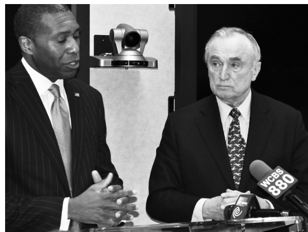
Associate Attorney General Tony West and Commissioner Bill Bratton

If we don't get this right, we squander the promise of democracy. A lever is needed to move this forward, and law enforcement must be the fulcrum. We can show the world the way democracy was meant to be. I do believe that we can get this right. Today, let's find a way to be the fulcrum so that when society uses the lever, it is on a strong foundation.