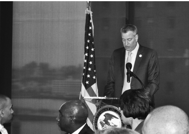
New York Mayor Bill de Blasio

Attorney General Eric Holder addressed the group via video. He declared that community policing must play a central role in reducing the risk of exposure to violence for boys and young men of color, both as victims and as perpetrators. He emphasized the need for trust between law enforcement and community leaders and the importance of finding a better way forward to achieve this goal: