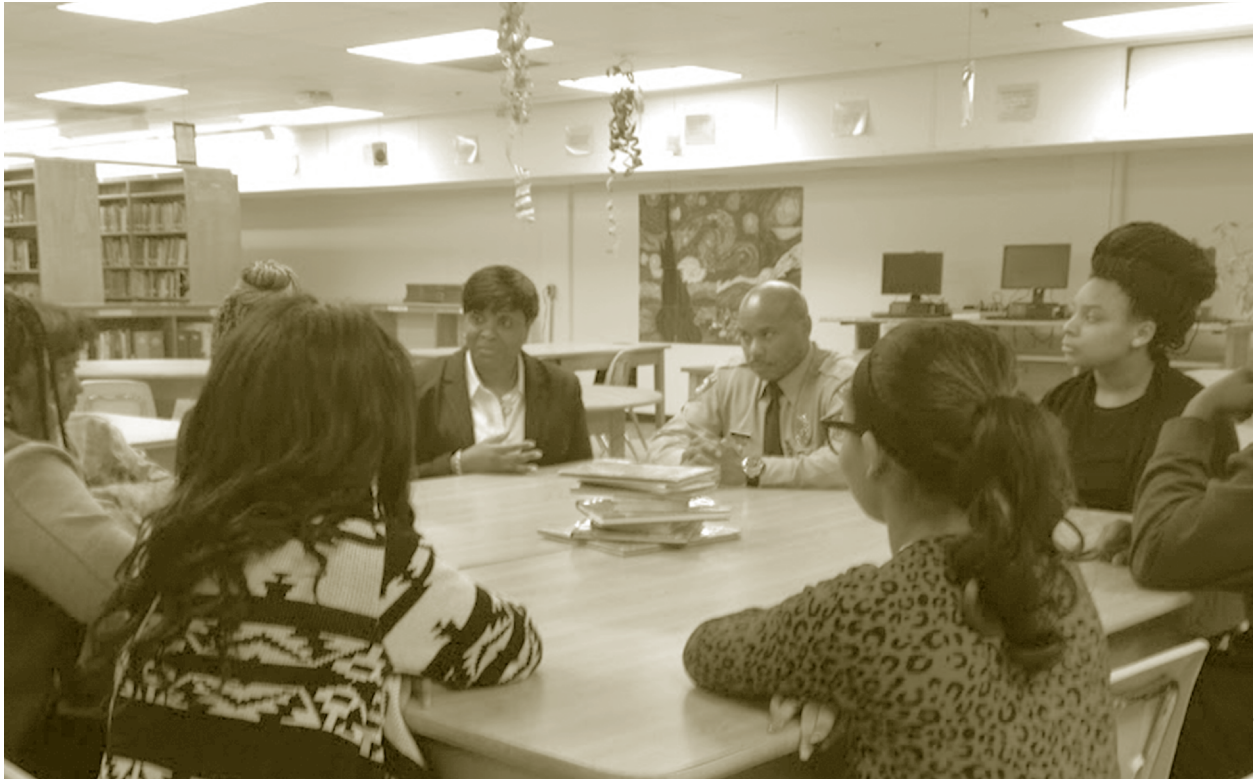
The Working Group

Law enforcement and SROs who are aware of these issues can help students learn better ways to behave by using strategies described in the previous section and engaging with students as a role model, mentor, educator, and informal counselor who has the student's back and helps him or her stay out of the pipeline to prison.