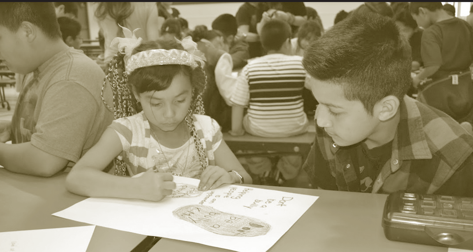
At Grimmer Elementary School in Fremont, California, a sixth grader mentors a first grader to take a stand against bullying.