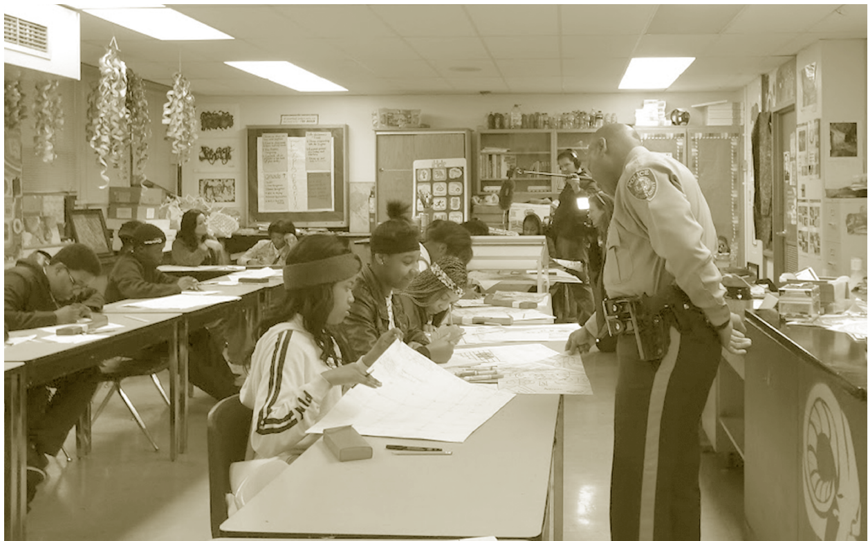
The Working Group

By becoming involved in Not In Our School , community members can model and practice empathy, thoughtful responses, and respect for different backgrounds, races, ethnicities, religions, and gender identities.