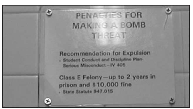
Signs should clearly communicate to students the prohibition against and penalties for making bomb threats.

7. Fostering a positive school climate, free of aggression. Considerable research has been conducted in the United States and elsewhere on the effectiveness of using a "whole school approach"<sup>23</sup> to reduce acts of violence and aggression.<sup>†</sup> The overall social and moral climate of the school can have significant effects on reducing school violence. Other approaches have also demonstrated a reduction in the amount of school disruption and violence. These include those targeted at anger management, adolescent positive choices, conflict resolution, classroom behavior management, and anti-bullying programs.<sup>24</sup> However, the effectiveness of these approaches varies according to school locality, and they are usually more effective if targeted at high-risk students.<sup>25</sup> Peer mediation and counseling has generally not been found effective in reducing problem behavior. And in the case of drug use, instruction by law enforcement officers concerning the legal penalties and negative effects of drug use have not been found effective.<sup>26</sup> Thus, you will need to research with the school the appropriate type of intervention that fits its needs. The following guidelines are recommended: