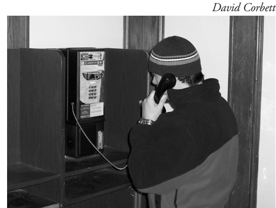
Bomb threats have often been called in via pay phones which reduced the likelihood that police could locate the individual placing the call.