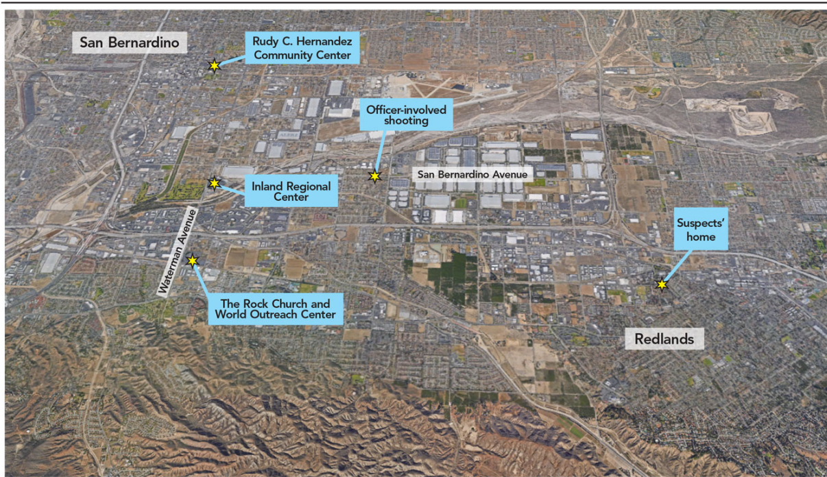
Figure 5. Relative locations of events and staging areas