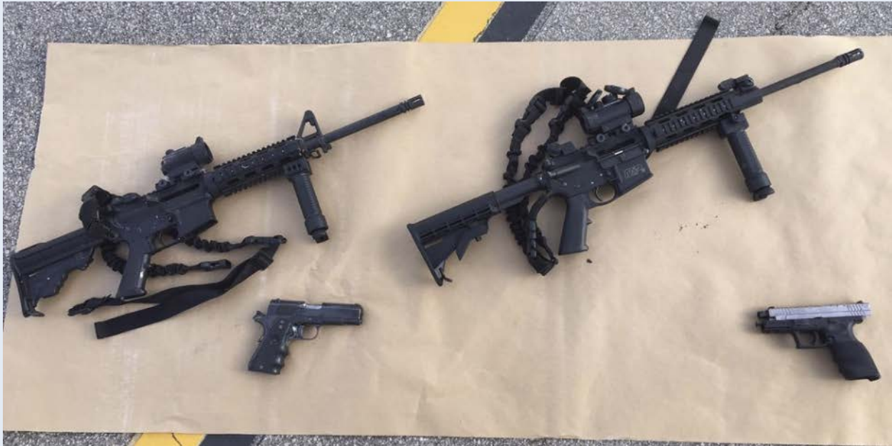
The AR-15 rifles (top) and handguns (bottom) used in the attack

The Colt ArmaLite Rifle 15, more widely known as the AR-15, is the civilian version of the Military's M-16 rifle originally designed by ArmaLite. This rifle is semiautomatic (one shot for each pull of the trigger) and uses a detachable box magazine to hold multiple cartridges. It was originally designed for the 5.56x45mm NATO cartridge; however, the AR-15 is now available in many different calibers and produced by many different manufacturers.