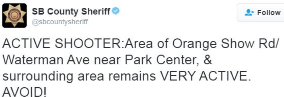
Figure 3. Tweet from SB County Sheriff’s Office

Source: SB County Sheriff (@sbcountysheriff), “ACTIVE SHOOTER:Area of Orange Show Rd/ Waterman Ave near Park Center, & surrounding area remains VERY ACTIVE. AVOID!,” Twitter post, December 2, 2015, 11:51 a.m., https://twitter.com/sbcountysheriff/status/672141064073965568 .