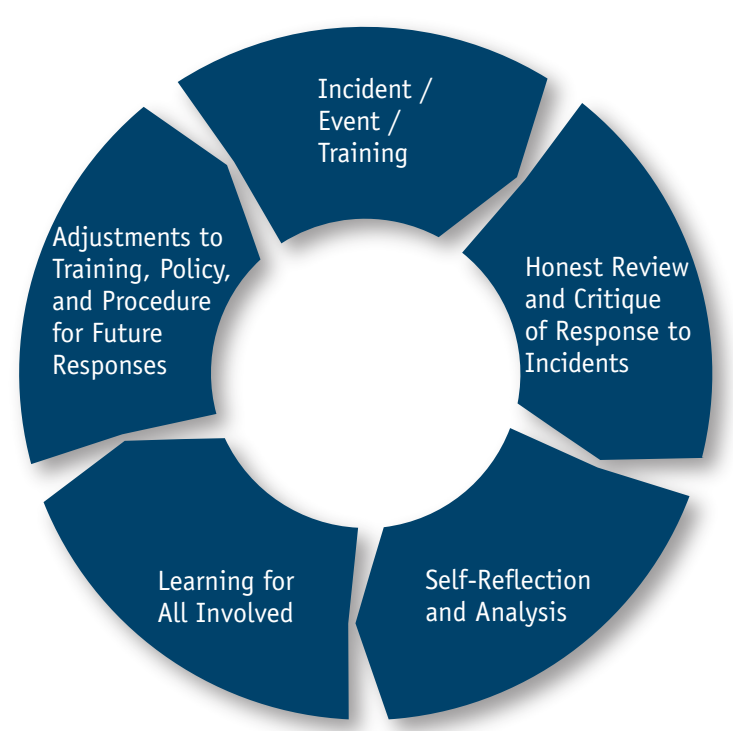
Figure 2. Process of after action reviews

The NIMS Incident Command System ICS protocol—which serves as the public safety industry standard for responding to and managing emergency events—includes ensuring that AARs are completed as one of the primary functions of the incident commander or unified command in any incident. Therefore, the industry standard for law enforcement agencies following major incidents is to develop an internal AAR process and to conduct AARs following incidents. NIMS protocol includes instructions and templates for completing AARs. These instructions and templates can also be scaled as needed for AARs following