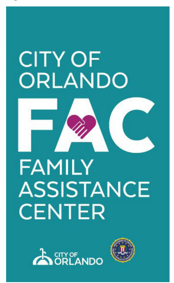
Figure 1. Advertisement of family assistance center available following the 2016 Orlando Pulse Nightclub attack