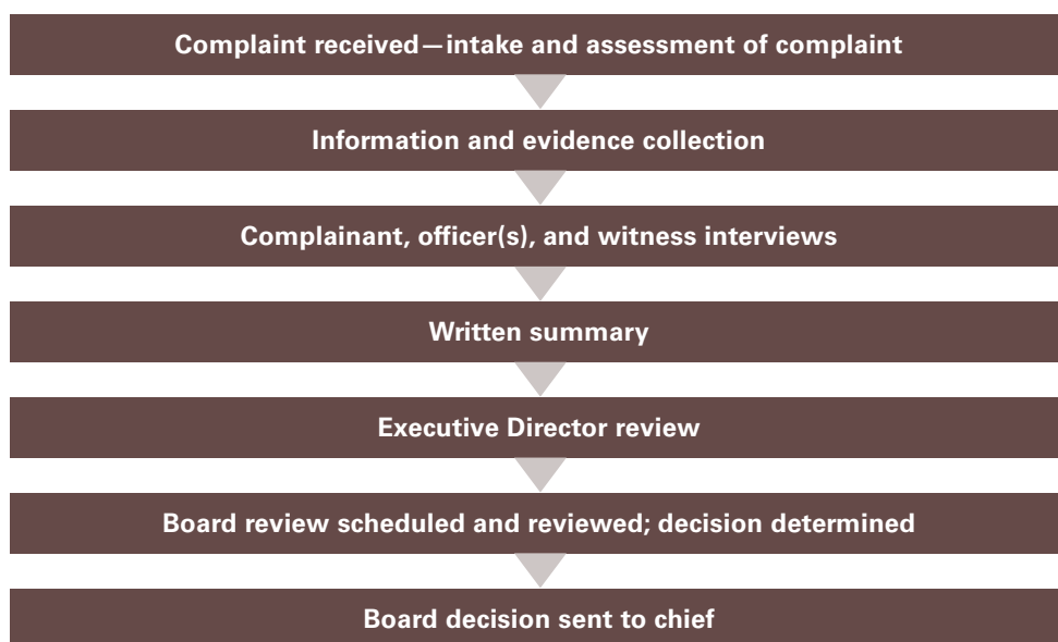
Figure 2. Summary of Atlanta Citizen Review Board Investigation and Adjudication Process