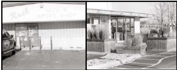
Installing pillars, posts or planters in front of store doors helps prevent burglars from driving vehicles through the doors.