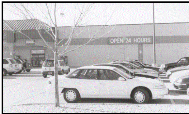
Stores that are open around the clock are protected from burglary by the constant presence of staff.