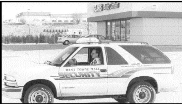
Private security patrols around large shopping malls help reduce burglaries to retail establishments located in and around the malls.

10. Employing security guards after hours. Burglars say that security guards pose the greatest threat to their activities. 32 Guards are widely employed in large malls and retail parks, which helps to account for the relatively low burglary rates of stores in these locations. An alternative adopted by some large stores is to employ a night crew that handles cleanup, restocking and display dressing. The store is protected from burglars while this necessary work gets done.