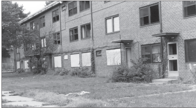
Urban areas with poorly-maintained, high-density low-income housing are often the site of open-air drug markets.

Savannah, Georgia.