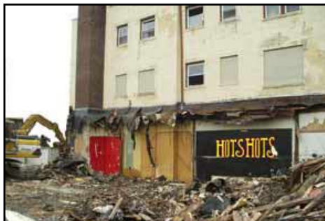
Demolition of a Former Bar and Drug Dealing Hot Spot: Removing a very risky facility can be the best way to reduce crime.