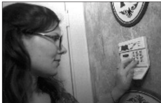
User errors account for a high percentage of false burglar alarms.