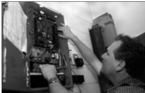
Proper installation of alarm systems is essential to prevent false alarms.